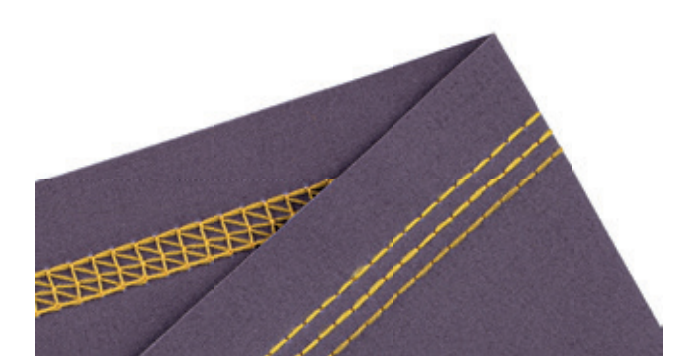
4-thread Cover Stitch (6 mm) elasticated cover seam and beautiful decorative effects connecting and decorative stitches