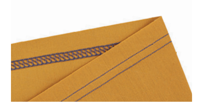
3-thread Cover Stitch wide (6 mm) for hemming and decorative effects

with their functionality, they also look great as decorative seams and give all sewing projects that special something.