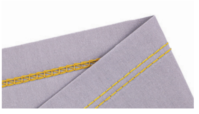
3-thread Cover Stitch narrow (3 mm) for hemming, sewing bindings and decorative effects